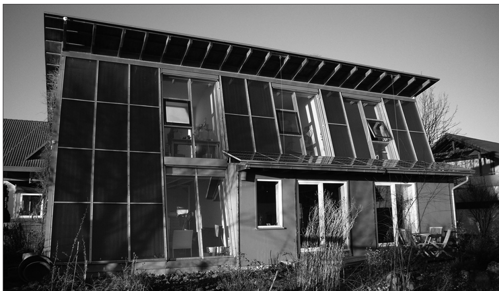
Solar-Active-Houses get most of their heat from the sun. Researchers carried out scientific tests to explore how this energy concept can be optimized further.