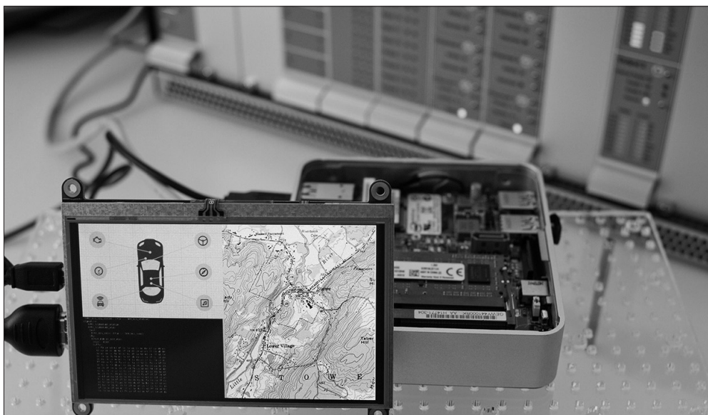
The head unit demonstrator protects manufacturer data as well as vehicle users' private data by preventing unauthorized extraction. (© Fraunhofer SIT) | Picture in color and printing quality: www.fraunhofer.de/press

"TPM security modules can now be found in almost every desktop and laptop computer; for example, they safeguard the BitLocker drive encryption program for Microsoft Windows," Fuchs says. "Our development environment is helping the TPM standard to become more widely used in automotive applications. It's now easier for manufacturers to implement security standards as well as the applications based on them. What's more, the platform could also be used in other sectors – for instance, as a secure means of controlling industrial plants or for application in the Internet of Things." The technology is already in line to be licensed for two industrial applications and the researchers are very close to a finished automotive product. Krauß concludes, "It's clear that we're heading towards a world of automated driving, which only underlines the importance of automotive IT security."