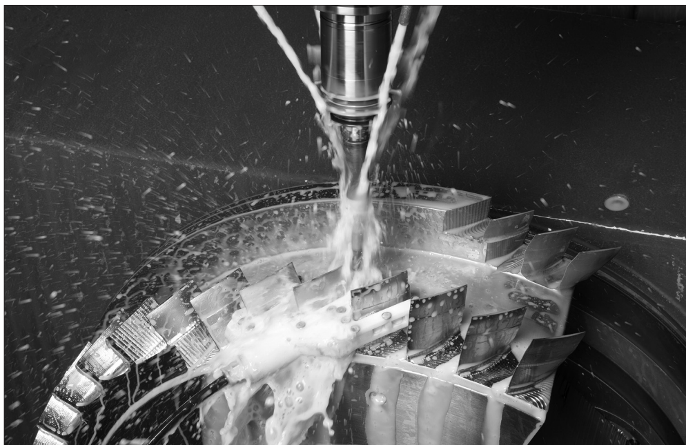
The three-part clamping system holds the blisk blades (just below the middle of the picture in white). Cooling lubricant is being injected from above. | Picture in color and printing quality: www.fraunhofer.de/press

example, the manufacturer reapplies the material using laser metal deposition and then mills it to the desired form. Workers attempt to hold the blade in place as best they can using clamps or rubber, but it is nearly impossible to align them perfectly. Consequently, the workpieces must be re-measured afterwards in a time-consuming process because it is not clear how much they have drifted to the left or right. The clamping system helps here, too. "It doesn't change the blisk's geometry by even a micrometer. The blade is fixed in place in just a few seconds and can be worked on immediately," says Kalocsay. The process is slightly different than with a new blisk, however: The clamping elements are arranged in a circle and hold, not one, but all blades at the same time.